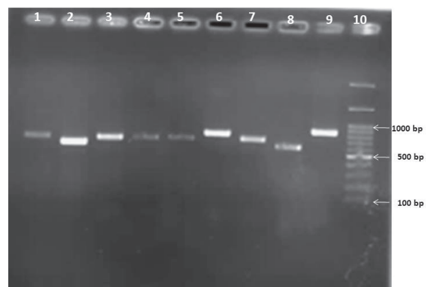
Figure 1. PCR Products of S. aureus coa Gene Isolated From Clinical Samples. Lane 1-9, PCR products and lane 10, 100-bp ladder.

Among the isolates recovered from skin lesions, PCR product of 650 bp was the most common one seen in 10 isolates, followed by 700 bp (nine isolates), 600 bp (five isolates), 800 and 850 bp (each one with 3 isolates). After enzymatic digestion with AluI in the PCR, 4 types of coa patterns ranging from 100 to 400 bp were observed. These types were designated as P1-P4 and the P1 type was the most predominantly noticed product sizes, accounting altogether for 35.71% of the total coa -positive isolates. As shown in Figure 2, the isolates with patterns P1 and P2 had DNA fragments of 250 and 400 bp, 250 and 350 bp, respectively. AluI digestion of the PCR products also yielded 3 PCR fragments in P3 type and 1 PCR fragment in P4 type.