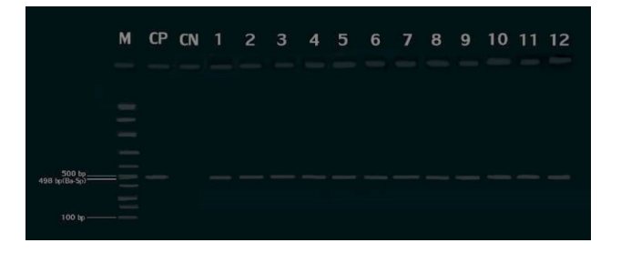
Figure 2. Agarose Gel Electrophoresis of PCR Products Generated From Omp 25 gene Amplification in B. abortus . M: 100 bp DNA Ladder (Sinaclon, Iran), CP: Positive Control (RB51 Strain), CN: Negative Control, Lanes1-12: Field Samples.

communal grazing or keeping different species of animals (cattle, sheep, and goat) tethered or at limited pastures. This provides favorable conditions for propagation of nonpreferred bacterial species among domestic animals (23). The spillover of B. melitensis from sheep and goat to cattle has previously been demonstrated in other studies (8,14). Generally, the animal breeding capacity of Kurdistan, an interest in consumption of unpasteurized milk and dairy products, and deregulation of trade and decreased animal traffic control in borders with neighboring countries are the plausible reasons for the burden of the infection in the given province (8,24-26). Notably, the results implied that the infection in small ruminants' population is currently prevalent in the region which should be considered in the future epizootiological surveillance programs.