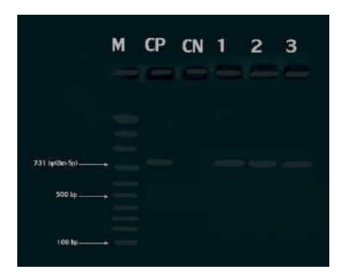
Figure 3. Agarose Gel Electrophoresis of PCR Products Generated from IS711 gene Amplification in B. Melitensis . M: 100 Bp DNA Ladder (Sinaclon, Iran), CP: Positive Control (Rev1 Strain), CN: Negative Control, Lanes1-3: Field Samples.

infection with B. suis (29), previous vaccination against brucellosis (30), and latent infectious status in the cases of inter-uterus infection or in the early postnatal period (5) are possible reasons producing false negative results. In addition, false positive serological results might be generated because of cross-reaction with E. coli , Vibrio cholera , Yersinia enterocolitica , and Francisella tularensis (5).