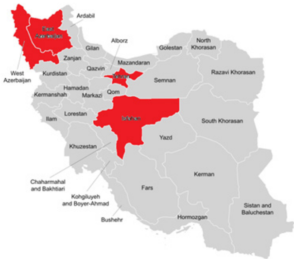
Figure 1. Distribution of Study Samples Across Various Cities of Iran.

level (71.6%, n = 144). Based on the results, the highest level of awareness (desirable class) about COVID-19 was related to the age range of 21-40 years (86.1%, n = 124) who had a bachelor’s degree (50.7%, n = 73) and were students (34.7%, n = 50). However, the lowest level of awareness (poor class) belonged to those who were within the age range of 21-40 years (71.4%, n = 5), had a bachelor’s degree (57.1%, n = 4),