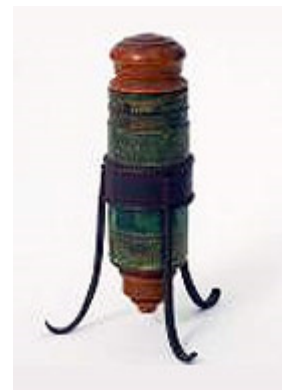
Figure 3. Galilei’s Compound Microscope (2).

to produce a sharp image), which was a breakthrough in microscope history that was based on trial and error till 1860.