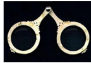
Figure 1. Salvino D’Armates’s Magnifying Eyepiece (1).