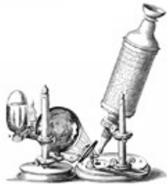
Figure 4. One of Robert Hooke's Observatory Devices (3).